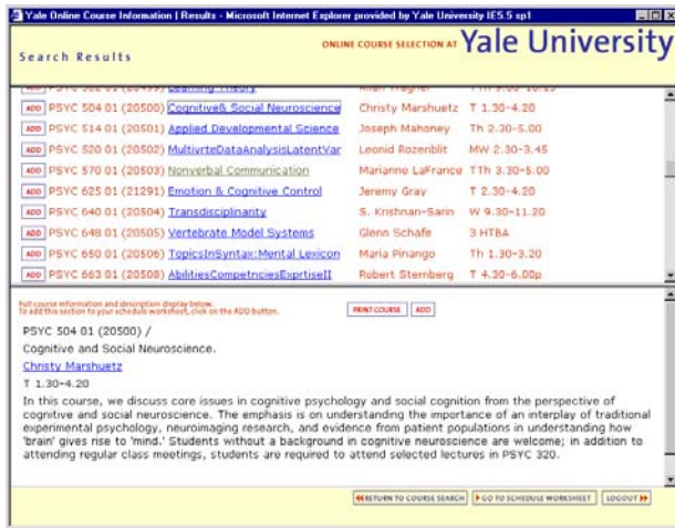
The Search Results page