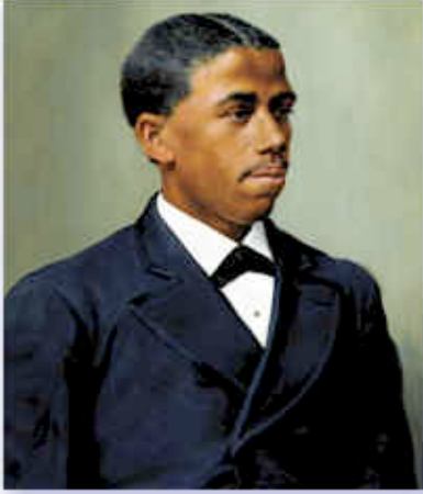
Edward Alexander Bouchet (1852-1918)

Edward Bouchet (1852-1918) was the first self-identified African American to earn a doctorate from an American university when he earned a Ph.D. in physics at Yale University in 1876. He was also one of the first African Americans to be elected to Phi Beta Kappa. He also was one of the first African Americans to graduate from Yale College in 1874. Bouchet was the sixth person in the western hemisphere to earn a doctorate in physics.