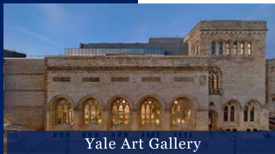
Yale Art Gallery

*A student whose program does not align with the academic term at Yale must apply at least 90 days prior to intended start date.