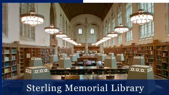
Sterling Memorial Library